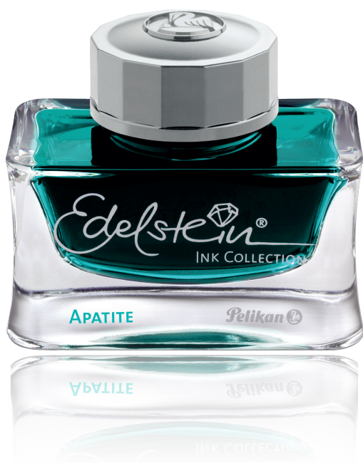
Flakon Apatite (50 ml)