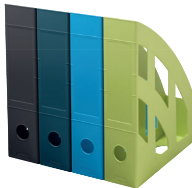
Magazine file classic A4-C4 recycling plastic material