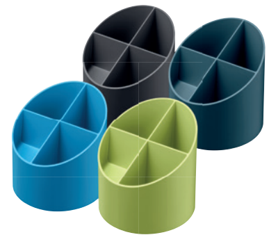
Pen stand round recycling plastic material