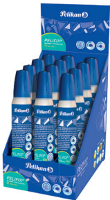
DISPLAY BOX W/12 PIECES