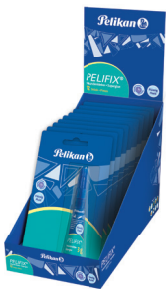
DISPLAY BOX W/12 PIECES