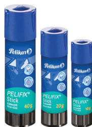
10 GR TRAY W/30 PIECES • 20 GR TRAY W/24 PIECES 40 GR TRAY W/12 PIECES