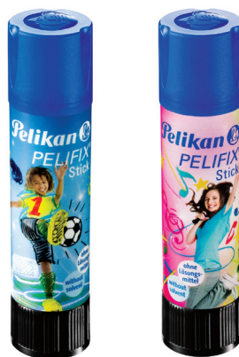
Pelifix design stick 10 g

Excellent for kids use with fun colorful designs