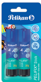
BLISTER CARD W/2 PIECES