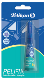
BLISTER CARD W/1 PIECE