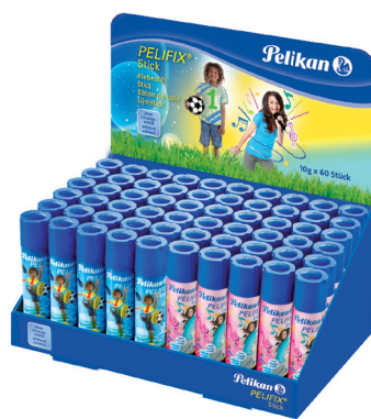
DISPLAY BOX W/60 PIECES