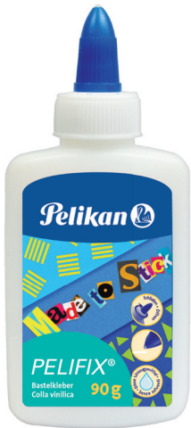
Pelifix Craft glue 90 g