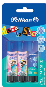
BLISTER CARD W/3 PIECES