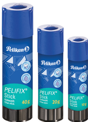
Pelifix 40 g • 20 g • 10 g