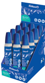
DISPLAY BOX W/12 PIECES