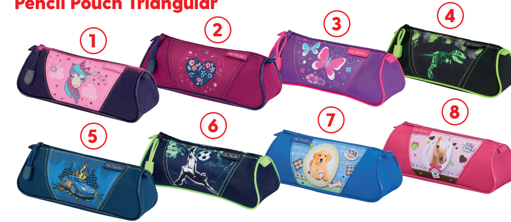
Pencil Pouch Triangular