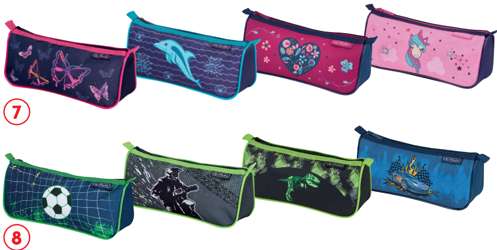
Pencil Pouch Sport