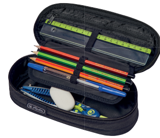
Pencil Pouch Case