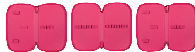
Triple Case empty