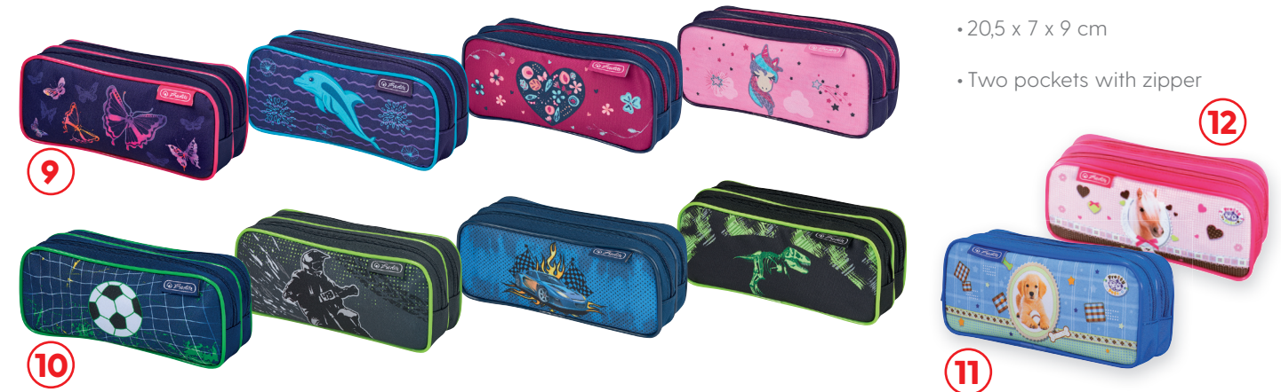
Double Pencil Pouch