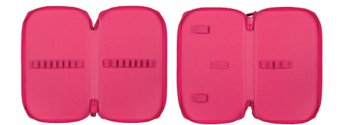
Double Case empty