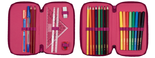
Double Pencil Case 23 pcs