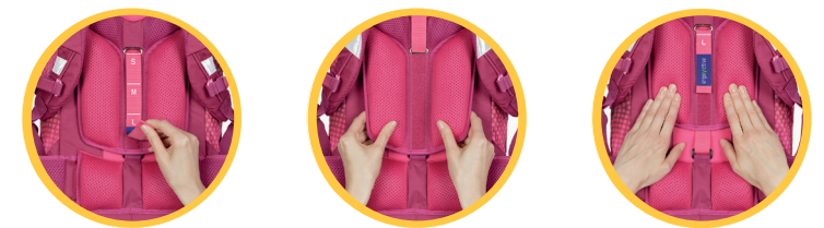
Loosen middle Velcro® fastener!