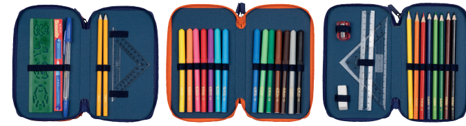
Triple Case 31 pcs