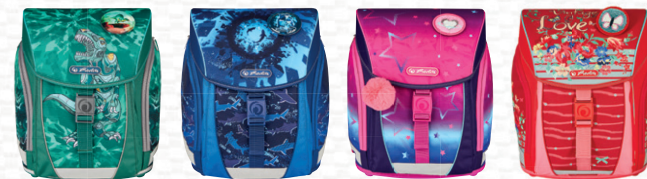
Heavy Metal Deep Sea Pink Stars Vintage Love