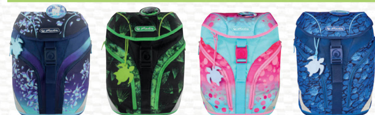
Blue Ice Explorer Pink Bubbles Deep Sea