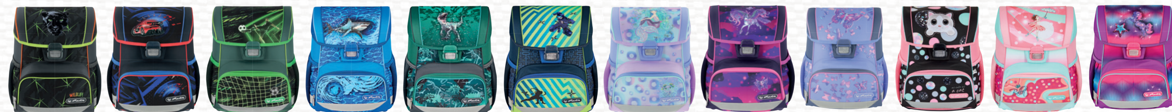
Wild Life High Speed Game Changer Blue Shark Green Rex Funky Ninja Mystic Mermaid Magic Unicorn Butterfly Paradise Cute Cat Ballet Love Funky Horse