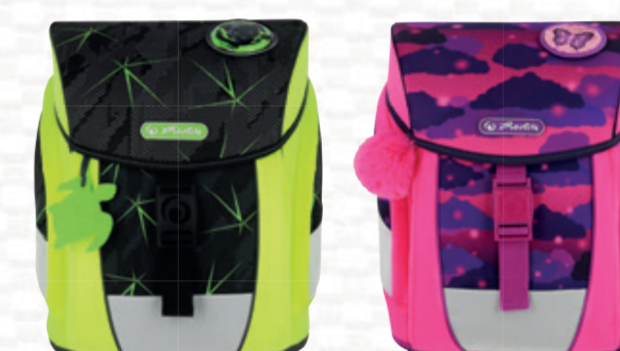
Wild Life Magic