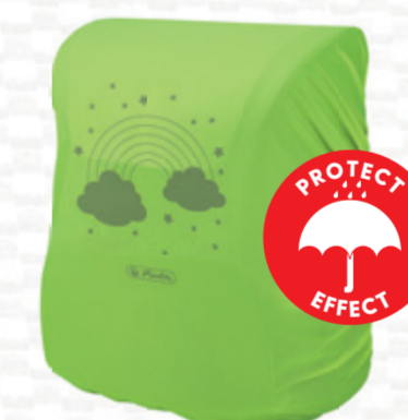
Raincover RRP 13,90 €