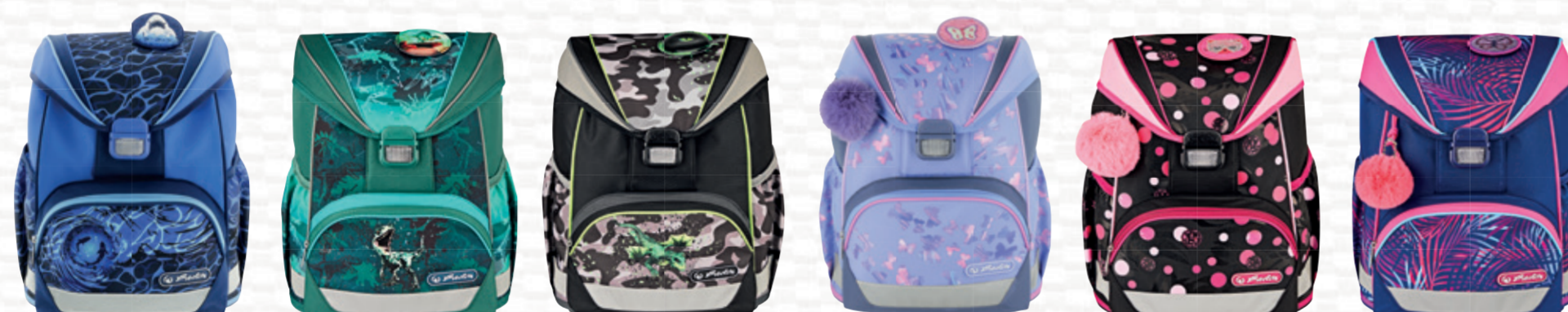
Blue Shark Green Rex Camo Dragon Butterfly Paradise Cats & Dots Tropical Chill