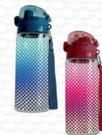
Drinking bottle 500 ml RRP 11,90 €