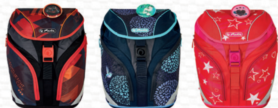
Sports Bloomy Birds Stars & Stripes