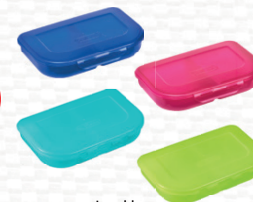
Lunchbox RRP 6,40 €