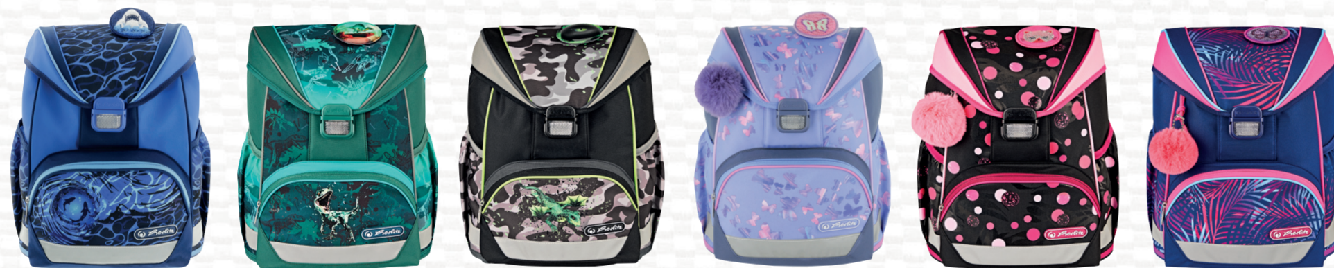
Blue Shark Green Rex Camo Dragon Butterfly Paradise Cats & Dots Tropical Chill