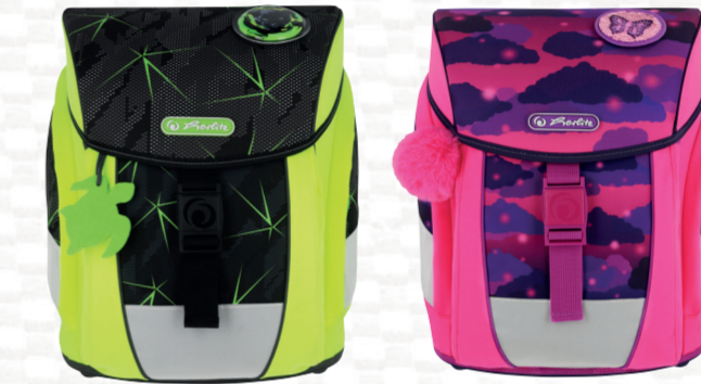
Wild Life Magic