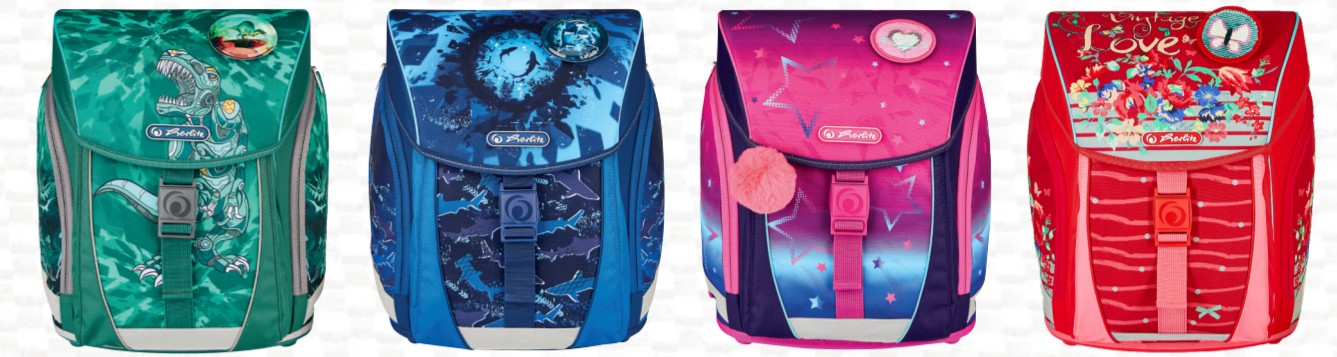
Heavy Metal Deep Sea Pink Stars Vintage Love