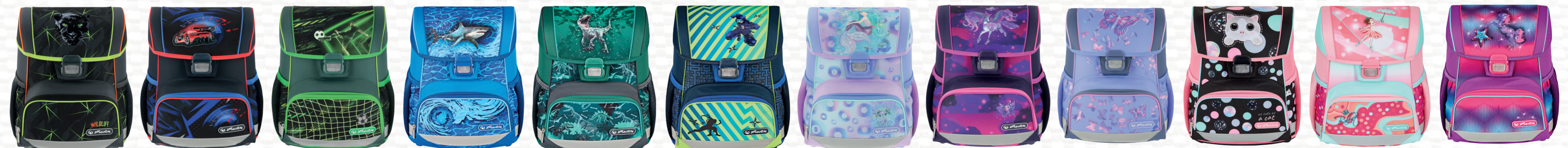
Wild Life High Speed Game Changer Blue Shark Green Rex Funky Ninja Mystic Mermaid Magic Unicorn Butterfly Paradise Cute Cat Ballet Love Funky Horse