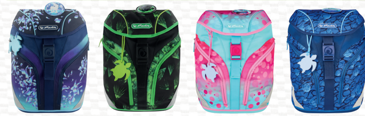
Blue Ice Explorer Pink Bubbles Deep Sea