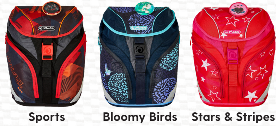
Sports Bloomy Birds Stars & Stripes